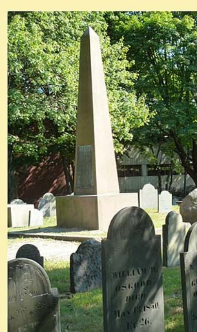
Governor John Brooks